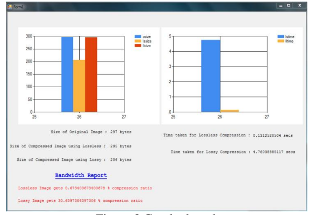
Figure 3 Graph plotted

The below snapshot is taken for the image which has more original size of 297 bytes. It can be compressed by 2 byte to form 295 bytes using lossless compression. Also it can be compressed up to 97 bytes using lossy compression technique.